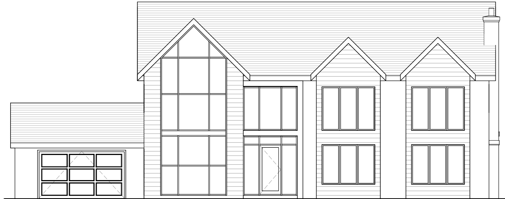
Proposed Front Elevation 1 : 100