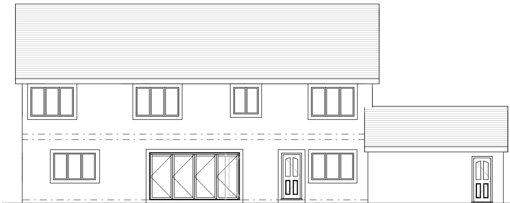
Proposed Rear Elevation 1 : 100